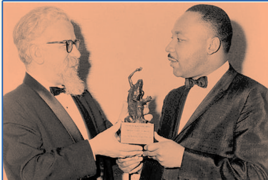
RABBI ABRAHAM JOSHUA HESCHEL